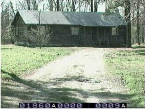
Last Photo Update 03/29/1997