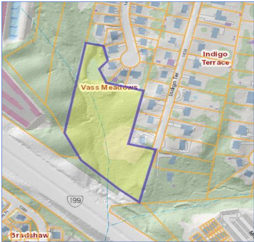
Legal Acreage: 5.7 Property Description: COMMON AREA VASS MEADOWS

Property Address: 3926 Vass Lane, Williamsburg VA 23188